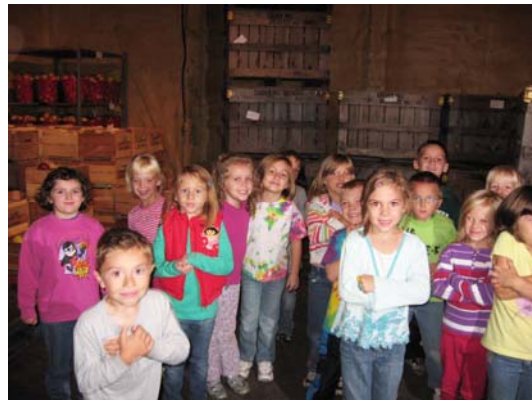
Leola Kindergarten at Cherry Hill Orchard